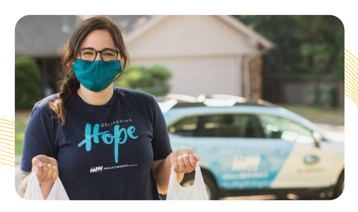
Meals on Wheels delivering Relief Meals