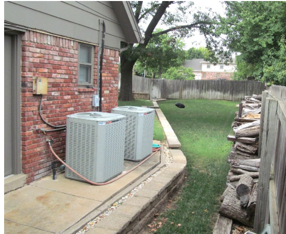
This platform and wall protect the home and air conditioning equipment from shallow flooding.

Berms or Redirected Drainage: Flood waters can be diverted away from your residence using berms, brick planter boxes and swales, but these may not be done in ways that cause damage to other properties. Owners and residents can request a meeting with a City engineer to discuss the best ways to solve existing drainage problems, and whether a Building Permit will be required. Contact the Customer Care Center at (918) 596-2100.