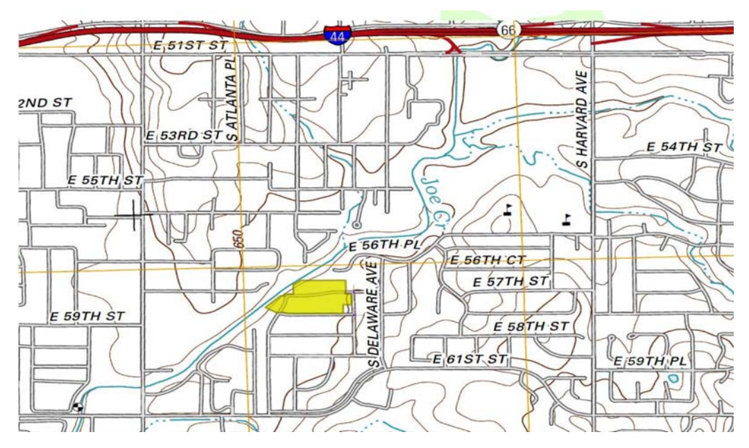
RLA #1 is located on the southeast side of Joe Creek, along E. 57<sup>th</sup> St. and E. 57<sup>th</sup> Pl., between S. Birmingham Ave. and S. Columbia Pl.

The general location of RLA #1 is shown on the map below, and a more detailed aerial photo/topography map on page 4. The detailed map identifies residential properties, County Assessor parcels, floodplains and the existing storm sewers and inlets system.