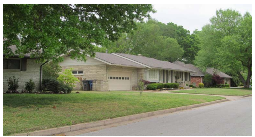
Since the completion of channel improvements along Joe Creek in the 1980's, the causes of flooding have been largely due to the level terrain, surface drainage issues. and slab-on-grade foundations.