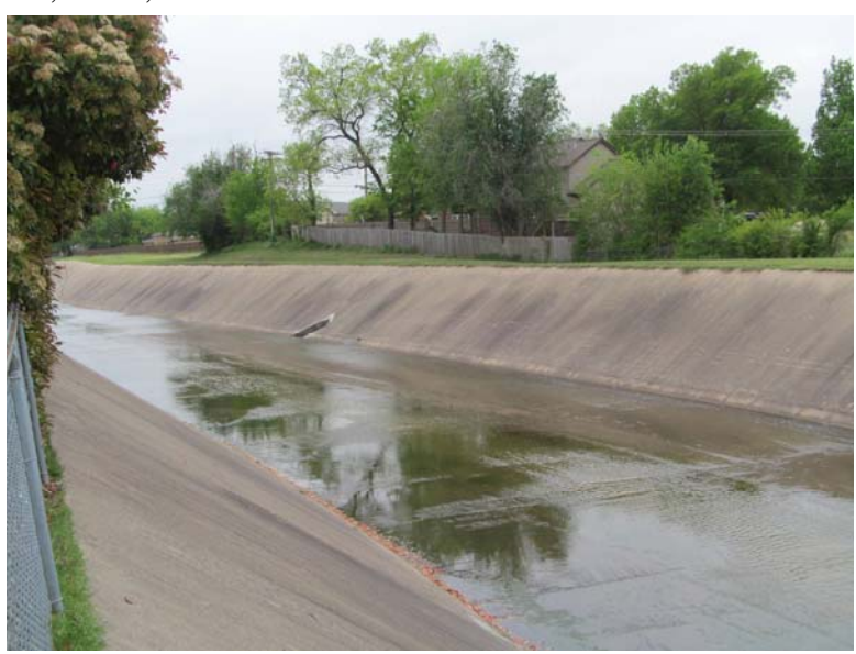
Joe Creek channelization near E. 57<sup>th</sup> St. and Birmingham Ave.

bridge. The 19 residences that make up the RLA are all on the southeast side of the stream, along 57<sup>th</sup> St. and 57<sup>th</sup> Pl., between Joe Creek and S. Columbia Ave. The residences are situated in the Joe Creek alluvial floodplain at between 646 and 650 ft. elevation. The terrain is generally flat and some of the properties have been subject to shallow street and overland drainage flooding during very heavy rains.