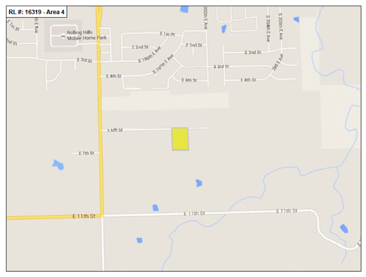
RLA #4 is situated in the Spunky Creek drainage in Wagoner County, on the south side of E. 6<sup>th</sup> St., just east of County Line Rd. (193 E. Ave.)

Consequently, one of the requirements of the CRS is that communities identify all repetitive loss properties in their jurisdiction and work with the owners in finding ways to reduce or eliminate future flood damage. This initiative has been very successful in reducing flood losses and claims.