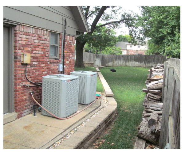
This platform and wall protect the home and air conditioning equipment from shallow flooding.

Create Berms, Swales or Redirected Drainage. Flood waters can be diverted away from your structures using berms, brick planter boxes and swales, but these may not be done in ways that cause damage to other properties. Owners and residents can request a meeting with a City Engineer to discuss the best ways to solve existing drainage problems, and whether a Building Permit will be required. This may be the most feasible solution for areas with flooding due to overland flow, as in RLA #4.