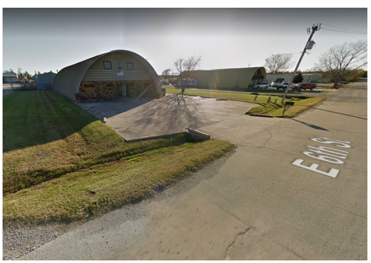
RLA #4 has shallow bar ditches in gently sloping terrain.

Ave.) in Wagoner County. The properties are at an elevation of between 638 and 640 feet on land that slopes gently northwards down towards Rolling Hills Creek. Runoff flows from the higher ground to the south, west and east into the parking lots at the rear of the buildings in RLA #4 and into the shallow bar ditches along E. 6<sup>th</sup> St. The structures in the RLA are situated slightly below the level of E. 6<sup>th</sup> St.