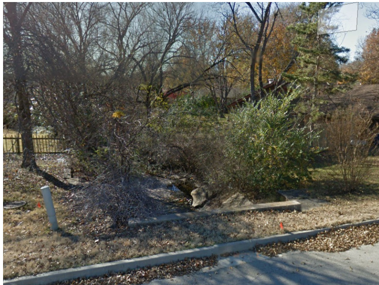
West Tributary to Fred Creek, looking downstream from E. 67 th St.

The Fred Creek is a 4.5-mile-long, left-bank tributary to the Arkansas River that drains 3.76-square-miles of southeast Tulsa. The creek rises in five principal branches at about the 750-ft. contour in the south Tulsa hills, near E. 69 th St. and S. Columbia Ave., E. 67 th and S. Florence Ave., E. 66 th and S. Marion Ave., E. 68 th and S. Yale Ave., and E. 73 rd and Yale Ave. The stream flows generally to the south and west through fully developed neighborhoods and across the