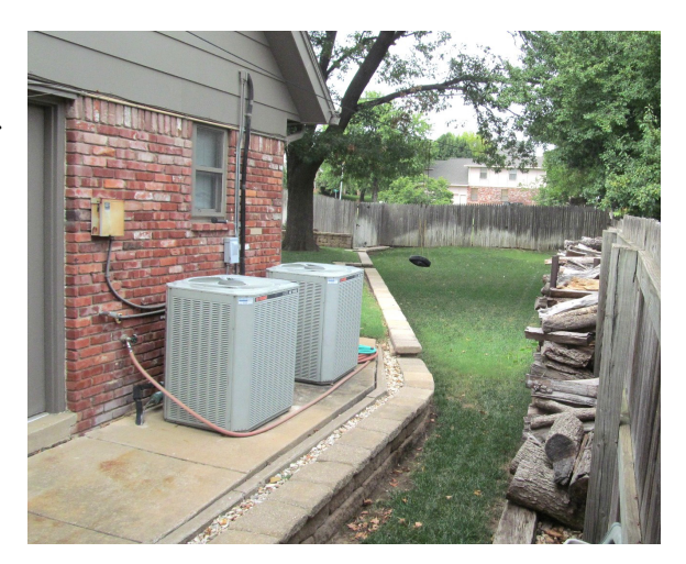
This platform and wall protect the home and air conditioning equipment from shallow flooding.

what steps they can to protect their homes, families and possessions. City staff is available to explain the local flood risk. interpret floodplain maps, and determine if an area or property has drainage problems or a history of prior flooding. Staff can also discuss the ways a specific property can be protected from flooding. An Elevation Certificate can help define a property's flood risk under various rainfall scenarios (e.g., in a 10-year, 50-year, 100year, or 300-year storm). You can receive a free flood zone determination by contacting the City with the correct legal description and street address, or the Tax Assessor/Parcel Number of the property.