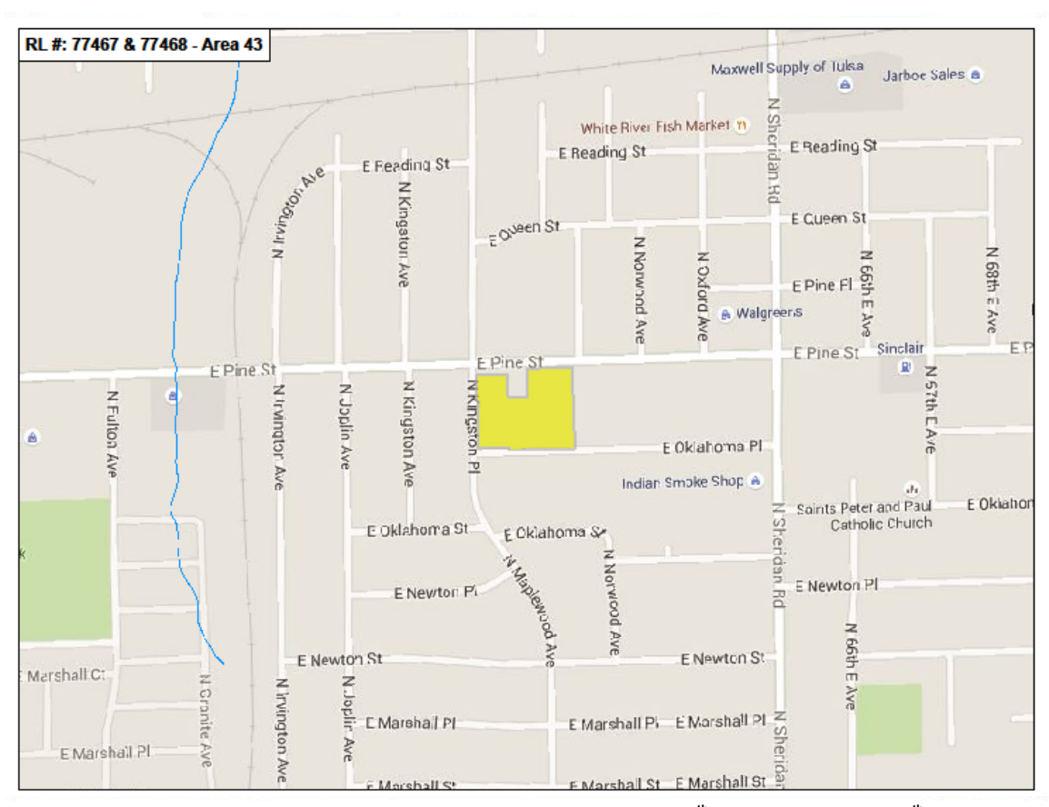
RLA #43 is situated in the Fry Ditch No. 2 drainage between S. 69<sup>th</sup> E. Ave. between E. 97<sup>th</sup> St. and E. 98<sup>th</sup> St.

Tulsa joined the NFIP in 1974, and through great effort and considerable expense has significantly reduced its exposure to flooding. As a result, Tulsa has been awarded a Class II rating in the NFIP's Community Rating System (CRS), which grants its residents a 40 percent discount on the cost of flood insurance for structures in the Special Flood Hazard Area (SFHA), also known as the 1% or 100-year floodplain. Since the Biggert-Waters Flood Insurance Reform Act of 2012, many properties have seen a substantial increase in their premiums, making this discount even more important.