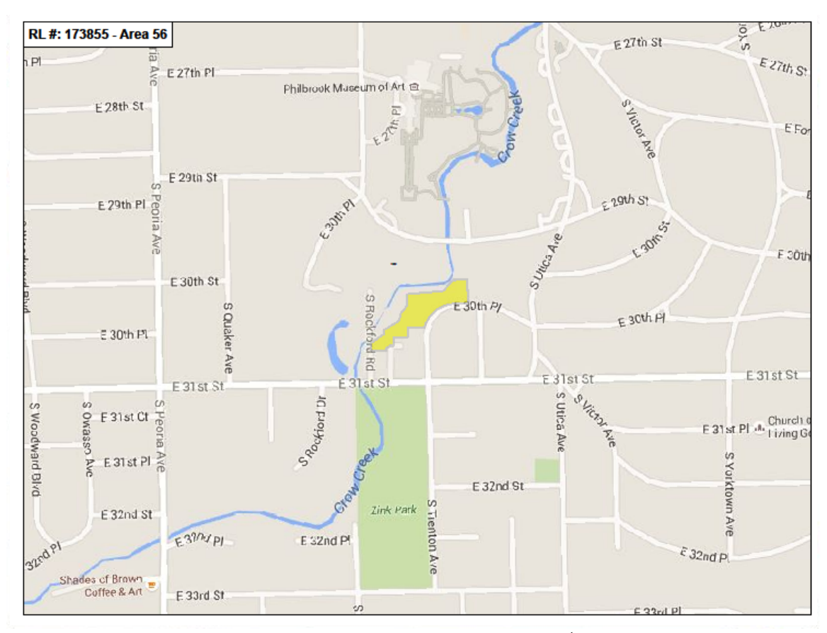
RLA #56 is situated along the east bank of Crow Creek just north of E. 31<sup>st</sup> St., between S. Rockford Rd. on the west and S. Troost Ave. on the east.

Tulsa joined the NFIP in 1974, and through great effort and considerable expense has significantly reduced its exposure to flooding. As a result, Tulsa has been awarded a Class II rating in the NFIP's Community Rating System (CRS), which grants its residents a 40 percent discount on the cost of flood insurance for structures in the Special Flood Hazard Area (SFHA), also known as the 1% or 100-year floodplain. Since the Biggert-Waters Flood Insurance Reform Act of 2012, many properties have seen a substantial increase in their premiums, making this discount even more important.