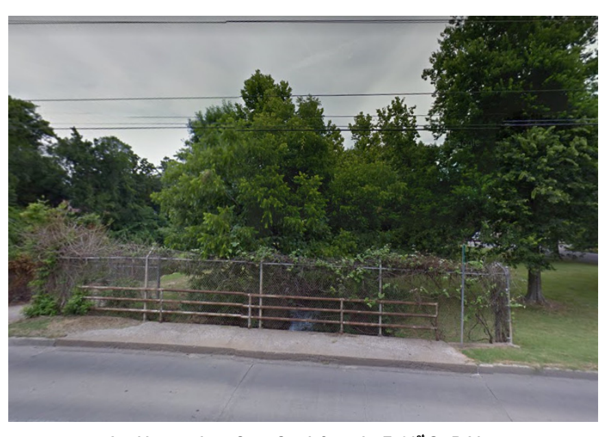
Looking north on Crow Creek from the E. 31st St. Bridge

The seven single-family residences of RLA #56 are situated along the east bank of Crow Creek just north of E. 31<sup>st</sup> St. bridge, between S. Rockford Rd. and S. Troost Ave., at an elevation of between 660 and 668 feet. All of the properties are within the City of Tulsa's 100-