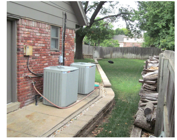
This platform and wall protect the home and air conditioning equipment from shallow flooding.

Install Local, Property-Specific Paving, Plantings and Catchment Basins. City Engineering staff can explain the natural functions of floodplains and how they act to slow and purify urban runoff and reduce flooding. Staff can also suggest low-